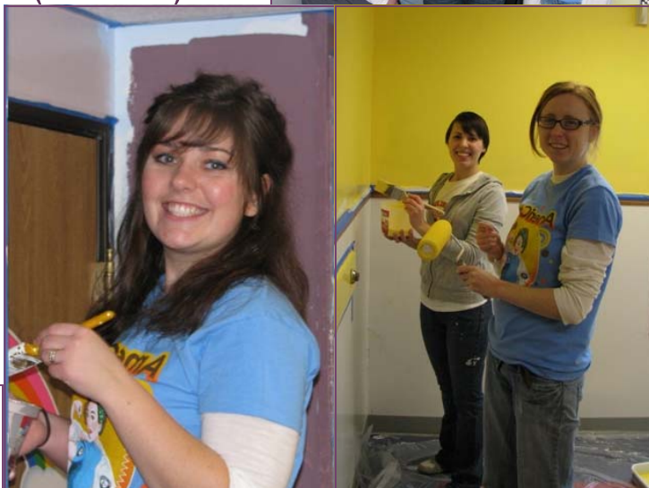
Right: AmeriCorps members complete service projects.

and/or food and supplies. REACH members recruited 245 volunteers who served more than 2570 hours at their programs. In addition, members facilitated 73 presentations in communities across Iowa.